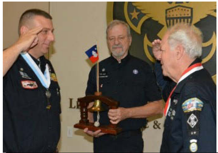
Sam Houston Area Council Change of Watch