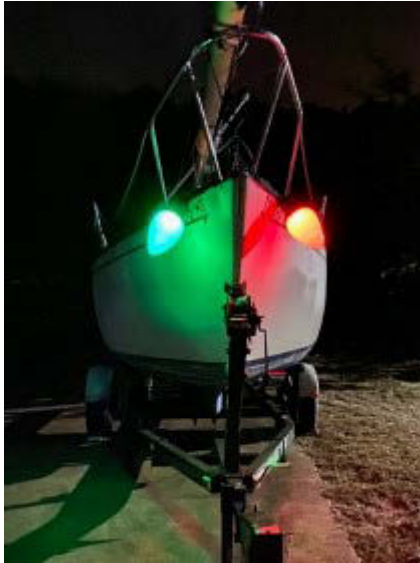
Ship 405 Christmas Cruise