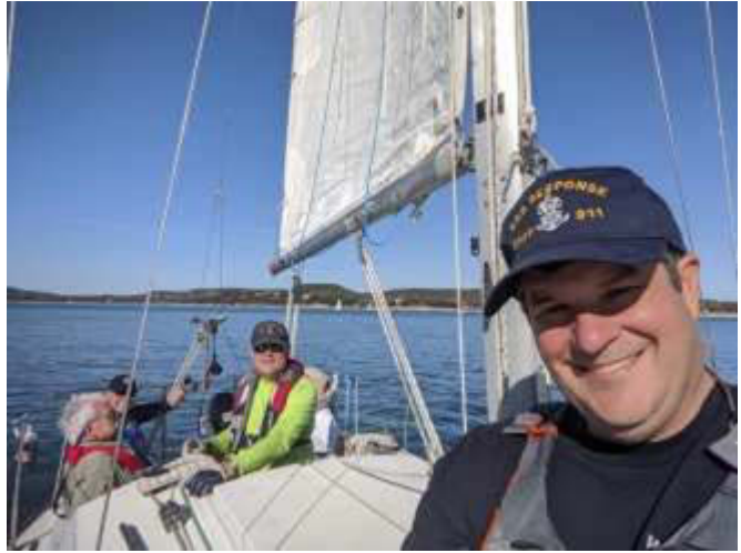
IOWLS on Lake Travis, Texas