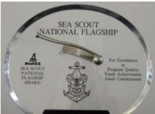
National Flagship Trophy