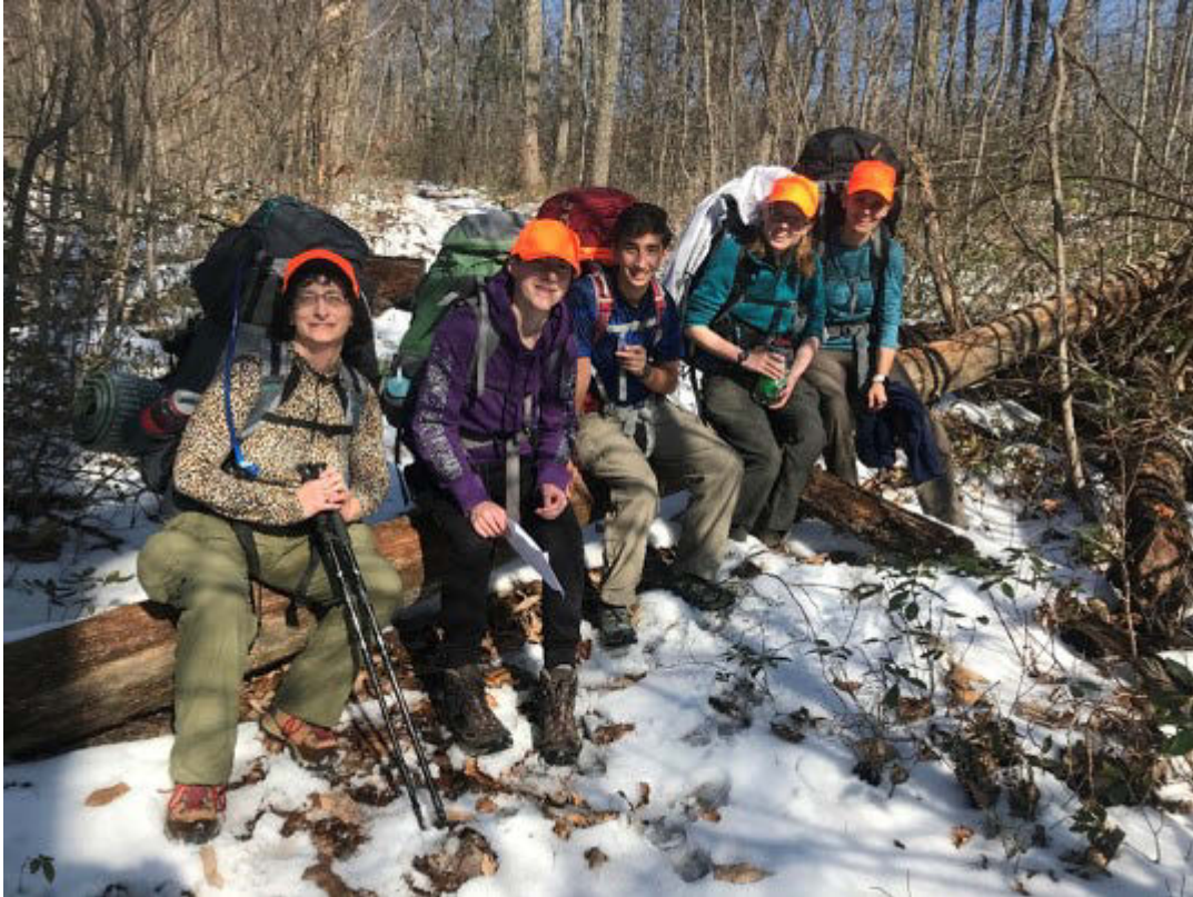
Crew 27 Backpacking Venturers on the Little Schloss Trail in orange hats

The trail turned out to be very hilly. It seemed to me that we spent a lot of time trekking uphill. The view from the trail made the walk up worthwhile. We got a great view of the surrounding mountain landscape.