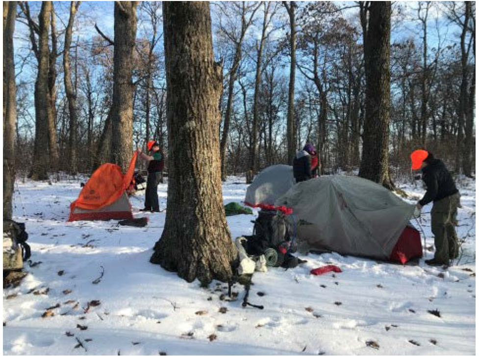
Crew 27 stopping before sunset on the Little Schloss Trail

The days are short in November and we learned that an earlier start would have been well advised. We weren't able to make it more than a few miles before it began to get dark so we had to stop earlier than planned. Everyone got their tents set up as quickly, we got the fire going and make dinner before it got dark. We melted snow to get potable water. The dehydrated backpacking food tasted pretty good after our afternoon of exercise. After packing all of our trash and leftover food away in bear-proof containers, we all went to bed. Despite only being 7:30 PM, it was already pitch-dark outside.