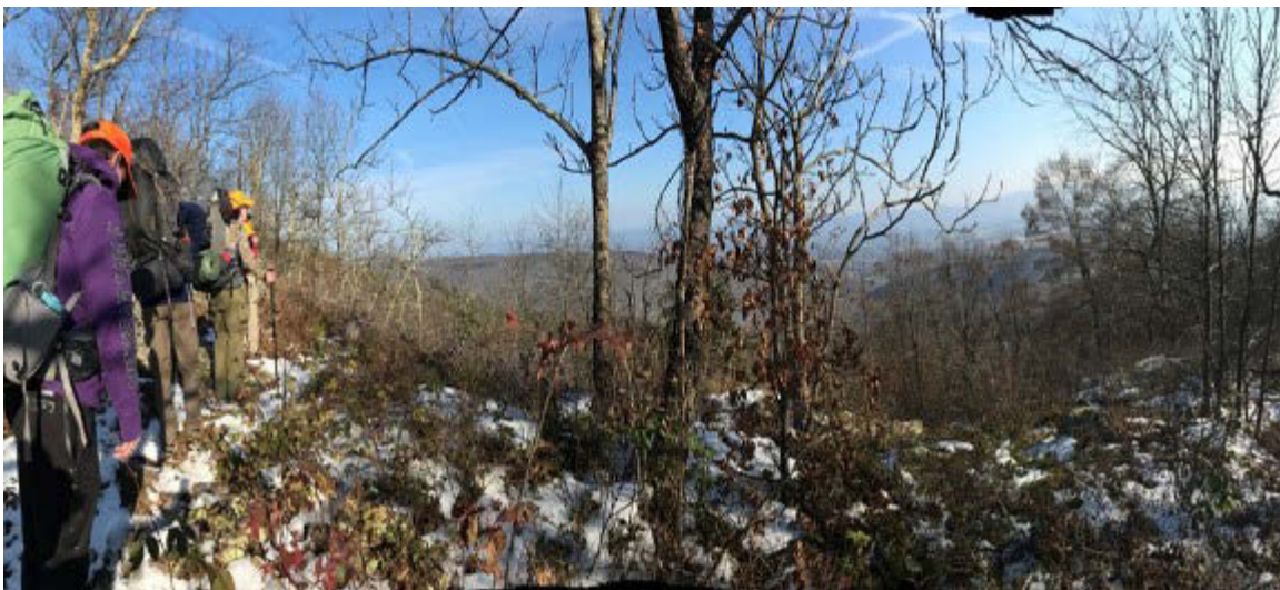
Beautiful late fall vistas along the Schloss Loops in the George Washington National Forest

The trail turned out to be very hilly. It seemed to me that we spent a lot of time trekking uphill. The view from the trail made the walk up worthwhile. We got a great view of the surrounding mountain landscape.