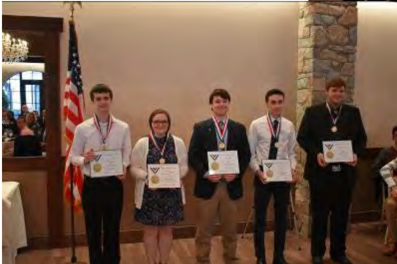
Youth Leadership Award 2019