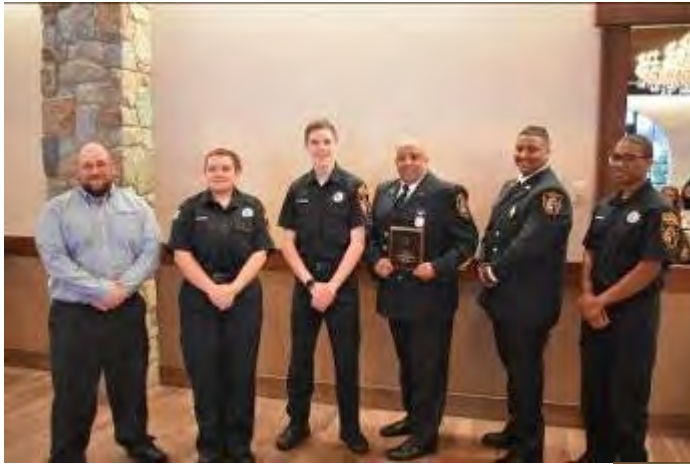
Explorer Post of the Year

The following are pictures of the award recipients with their awards