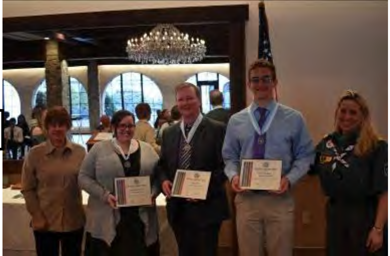
Venturing Leadership Award 2019