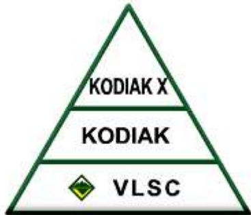
NATURE OF LEADERSHIP

The full Venturer (Youth) Development is covered in the SMD flyer at http://www.minsi-southmountain.com/documents/VenturerLeadershipDevelopment.pdf