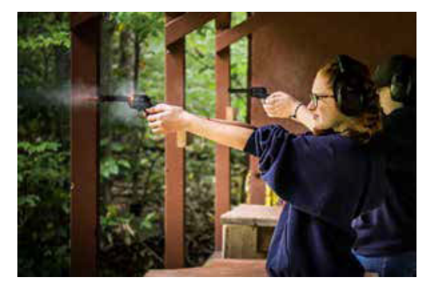
Fall Camporee, 2018