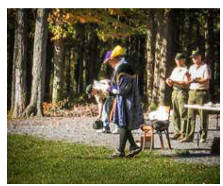
Fall Camporee, 2003