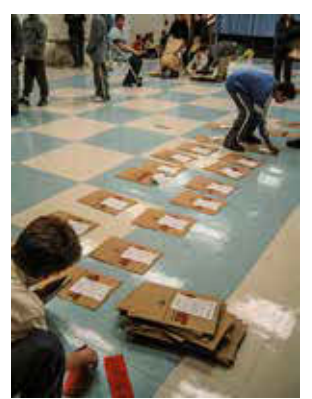
Scouting for Food, 2003