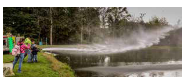
Fall Cub Event, 2018