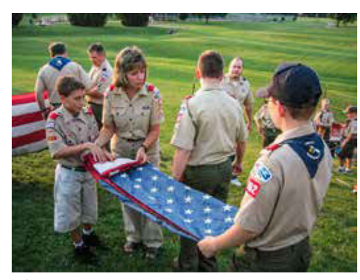
9/11 Flag retirement ceremony, 2003