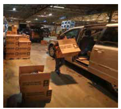
Popcorn pickup, 2018