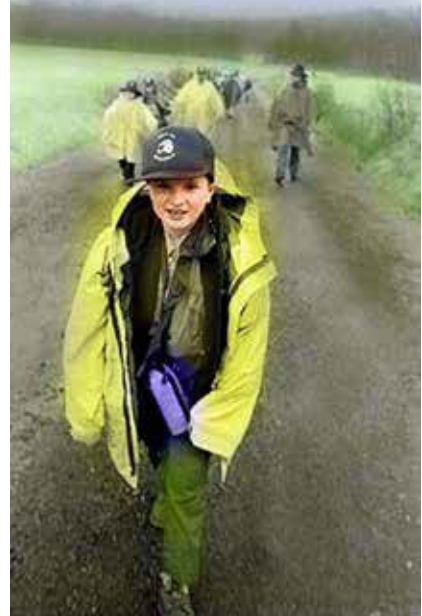
First Scout Hike, 2001