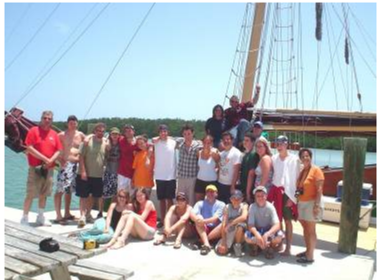
Venture Crew 42, from Easton, MA, participating in the Sea Exploring Adventure, which is part of Florida Sea Base.

Our week went by too quickly. We became a team of twenty people who were all able to learn what it was like to give up simple pleasures in life, such as flush toilets and showers, to enjoy their week on the water. Whether we were snorkeling around the numerous reefs, watching dolphins swim alongside our boat, fishing, watching tuna jump in the water, having a sing along, or just relaxing on the deck of the schooner, it is clear to say that we had an extraordinary vacation that will be talked about for years to come!